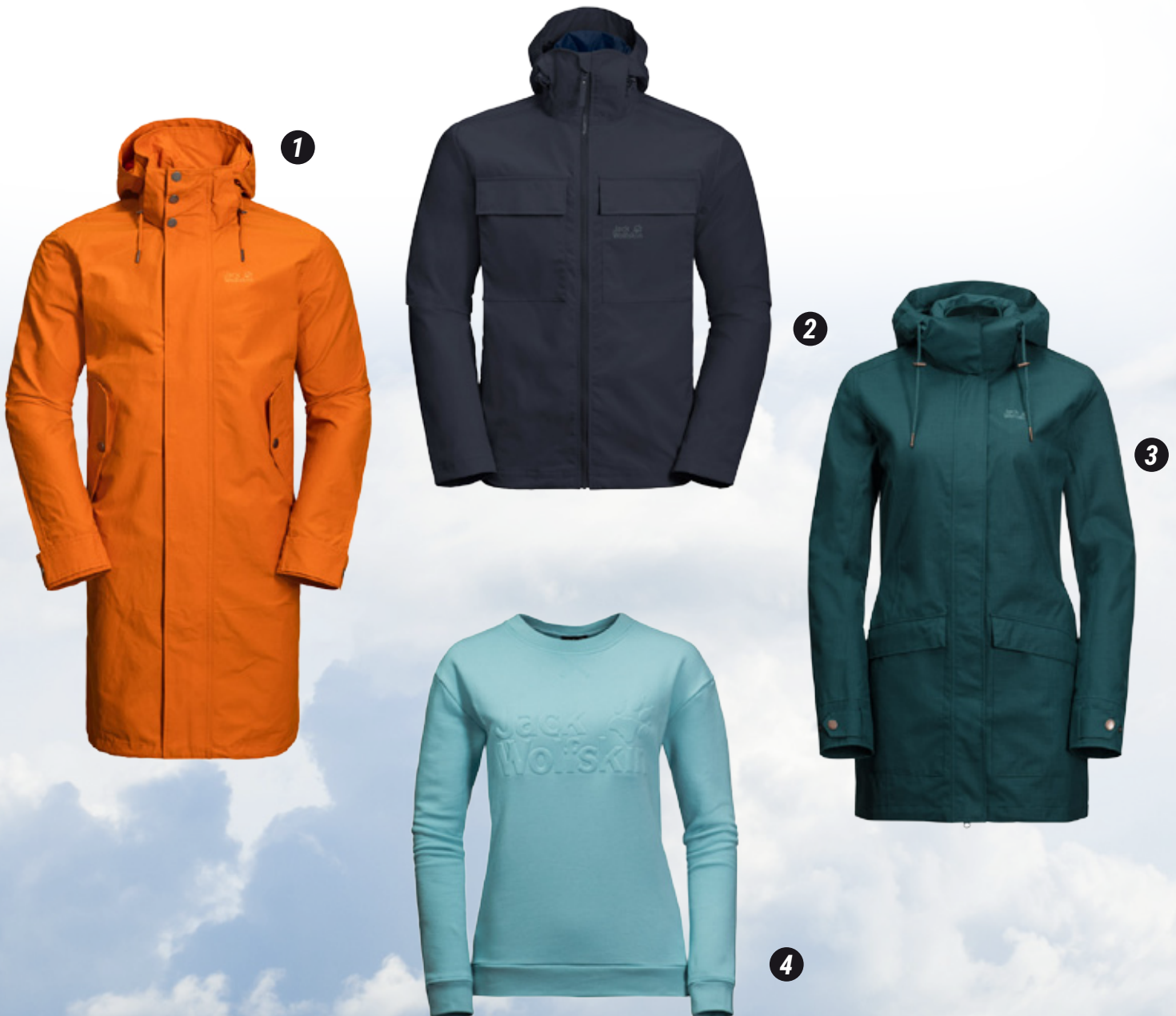
1 PORT LINCOLN PARKA MEN 3 ROCKY RIVER COAT WOMEN

and strong colours. The materials are 100 % PFC-free, and partly recycled in some styles. They look good , and they have an unusual, appealing feel .