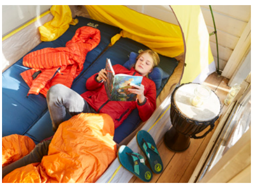
JACK WOLFSKIN supports the Steingässer family on their adventures since 2012.